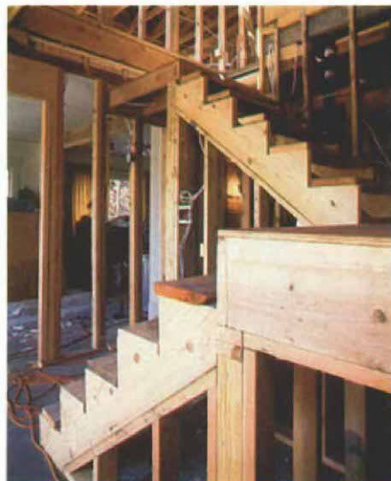
Two straight flights of stairs engage the first landing, which is built using standard stud-wall framing techniques and materials.

to buy just the premade treads, I decided to make my own. To trim the treads, I would use 1\frac{1}{16} -in. sq. bullnose trim on the front and open side. Using a separate piece for the bullnose trim would allow me to wrap the treads around the newel posts easily, and to hide the end grain of the treads.